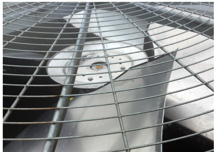
New Marley Ultra Quiet Fan

Contact your Marley representative to identify parts for other manufacturers' towers: spxcooling.com/replocator