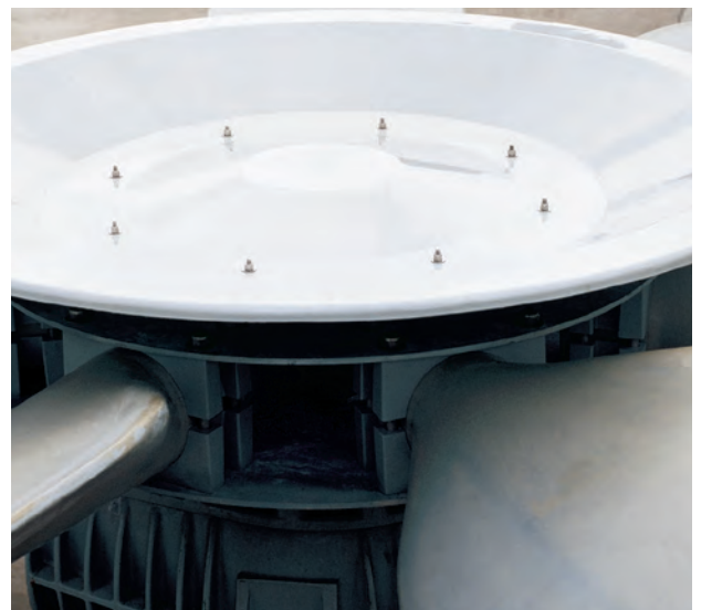
The HP7000 seal disc design helps enhance aerodynamic efficiency

At the center of the HP7000 is the time-tested, heavy-duty, dual-plate fan hub. Hot-dipped galvanized structural steel plates and epoxy coated cast iron blade clamps provide superior durability and corrosion resistance. For particularly corrosive conditions, we coat the complete hub with “triple epoxy” paint. For the most severe environments, we offer stainless steel plates that provide exceptional resistance to rust and corrosion.