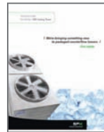
Marley MD Cooling Tower