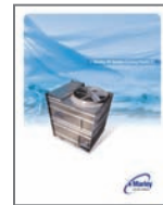
Marley AV Cooling Tower

SPX Cooling Technologies is a world-leading full-line cooling tower and air-cooled condenser manufacturer. The company provides exceptional-quality evaporative cooling towers, fluid coolers and evaporative condensers under the Marley, Recold and Balcke brand names.