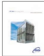
Marley NC Alpha Splash Fill Cooling Tower

SPX Cooling Technologies offers a full line of industry leading products – with exceptional support and innovation designed to help you get the most out of your cooling process. Take a look at these other SPX Cooling Technologies products: