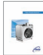
Marley Aquatower® Cooling Tower