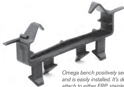
Omega bench positively secures fill bar and is easily installed. It's designed to firmly attach to either FRP, stainless, or vinyl coated wire grid.

Each bar will be retained in its grid by polypropylene fasteners. The attachment must isolate the fill bar from the grid to prevent premature wear on either part.