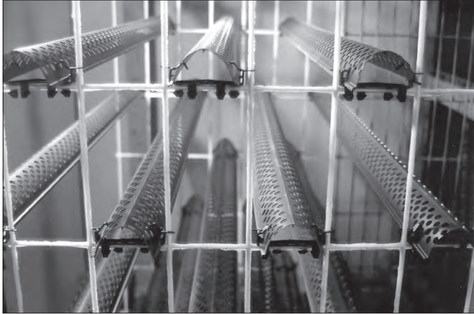
Omega installed parallel to airflow

Marley Omega splash fill bar advances the state of the art in cooling tower splash fill.