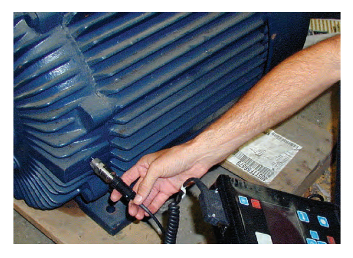
Use a handheld vibration monitor to check mechanical operation

sludge and accumulated debris provides an ideal breeding ground for bacteria, remove any buildup. Also, check the condition of the sump, sump screen and anti-cavitation device (if one is used). The sump screen should be free of trash.