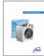
Marley Aquatower® Cooling Tower