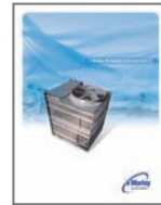
Marley AV Cooling Tower

SPX Cooling Technologies is a world-leading full-line cooling tower and air-cooled condenser manufacturer. The company provides exceptional-quality evaporative cooling towers, fluid coolers and evaporative condensers under the Marley, Recold and Balcke brand names.