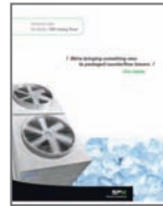
Marley MD Cooling Tower