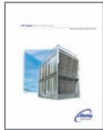
Marley NC Alpha Splash Fill Cooling Tower

SPX Cooling Technologies offers a full line of industry leading products – with exceptional support and innovation designed to help you get the most out of your cooling process. Take a look at these other SPX Cooling Technologies products: