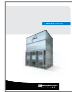
Marley MCW Cooling Tower