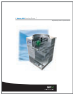
Engineering Data and Specifications

For further information about the MD Cooling Tower – including engineering schematics, data, layout requirements and more – ask your Marley sales representative for a copy of the following publications: