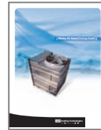
Marley AV Series Cooling Tower

SPX Cooling Technologies is a world-leading full-line cooling tower and air-cooled condenser manufacturer. The company provides the highest-quality evaporative cooling towers, fluid coolers and evaporative condensers under the Marley, Recold and Balcke brand names.