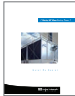
Marley NC® Class Cooling Tower

SPX Cooling Technologies offers a full line of industry leading products – with unmatched support and innovation designed to help you get the most out of your cooling process. Take a look at these other SPX Cooling Technologies products.