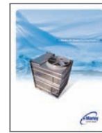
Marley AV Series Cooling Tower

SPX Cooling Technologies is a world-leading full-line cooling tower and air-cooled condenser manufacturer. The company provides exceptional-quality evaporative cooling towers, fluid coolers and evaporative condensers under the Marley, Recold and Balcke brand names.