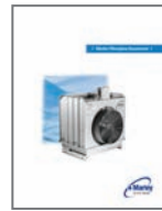
Marley Aquatower® Cooling Tower