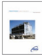
NC Steel Specifications