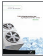
Marley MD Class Cooling Tower

SPX Cooling Technologies offers a full line of industry leading products – with exceptional support and innovation designed to help you get the most out of your cooling process. Take a look at these other SPX Cooling Technologies products: