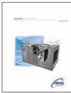
NC Steel Engineering Data