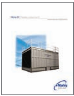
NC Fiberglass Engineering Data and Specifications

For further information about the NC Cooling Tower – including engineering schematics, data, layout requirements and more – ask your Marley sales representative for a copy or download at spxcooling.com :