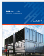
Marley MH Fluid Cooler

SPX Cooling offers a full line of industry leading products – with unmatched support and innovation designed to help you get the most out of your cooling process. Take a look at these and other cooling products at spxcooling.com .