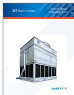
Engineering Data and Specifications

For further information about the DT Fluid Cooler – including engineering schematics, data, layout requirements and more – download at spxcooling.com