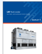
Marley LW Fluid Cooler