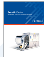
Recold JW Fluid Cooler