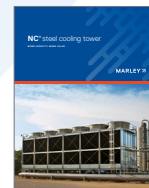
Marley NC Cooling Tower