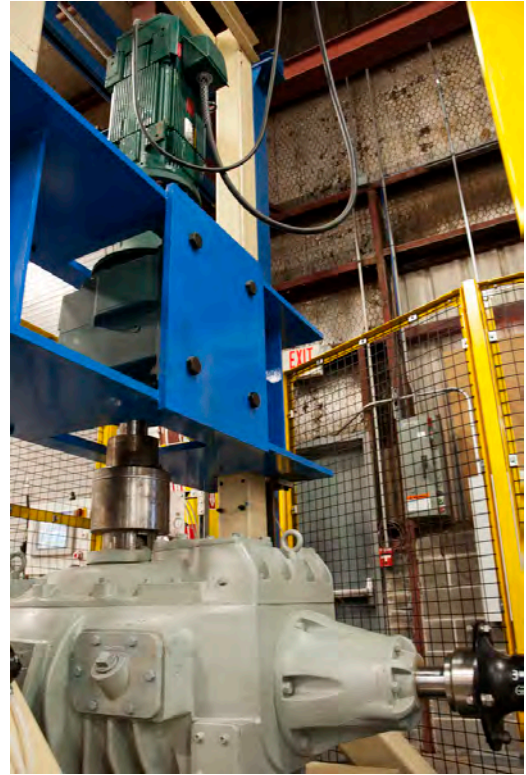
*The factory dyno-test under load ensures the gearbox has been re-assembled properly and is capable of running at the rated torque and horsepower.