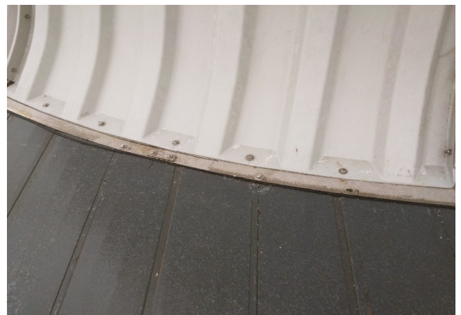
Reflex RTM Fan Cylinder plus Anchorage Ring 145 mph (233 kph) wind load capacity