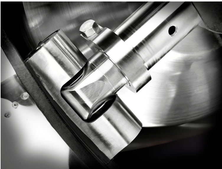
Fan blades are resiliently mounted to machined aluminum hub.