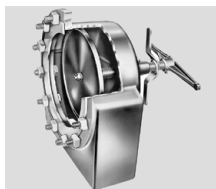
HC Crossflow Valve