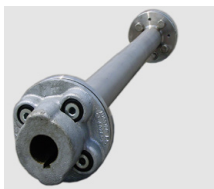
Driveshaft - Flex Bushing