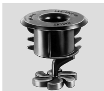
Spiral-Target Crossflow Nozzle