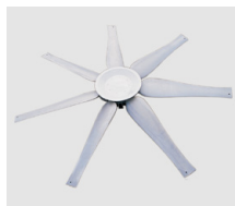
Marley HP7000 Fan