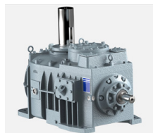
Geareducer® (M Series)