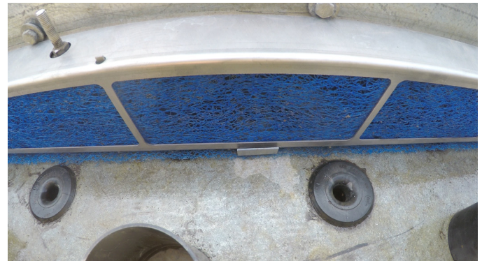
Marley NC 8400 Installation

See MarleyGard Basin Filter installation and replacement videos at spxcooling.com