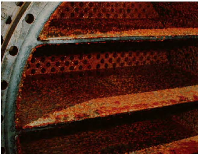
FIGURE 2 Corrosion, in general, and pitting corrosion, in particular, must be guarded against in order to ensure the long-term integrity of the cooling system

Corrosion: Corrosion is the process of metal dissolution, usually by oxidation, resulting in substantial material breakdown and premature degradation of system equipment. The oxidation process, in a very simplified form, is the movement of electrons from metal system components into the water medium provided in wet systems and subsequently to a corrosion product of substantially different form than the original base material. This process degrades the metal, reduces its strength, thickness, and in some extreme cases, creates pits and then holes in the material. At some point in the corrosion process, the metal can no longer do its job as a system component. Corrosion, in general, and pitting corrosion, in particular, must be guarded against in order to ensure the long term integrity of the cooling system. Extensive corrosion is shown in Figure 2 .