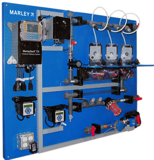
FIGURE 4 A modern packaged treatment pump and controller system is shown

Biological growth: In order to continuously and effectively operate a cooling system and establish sound biological control, first eliminate nutrient sources that may add material to the system, such as oil leaks, process fluid leaks and the like.