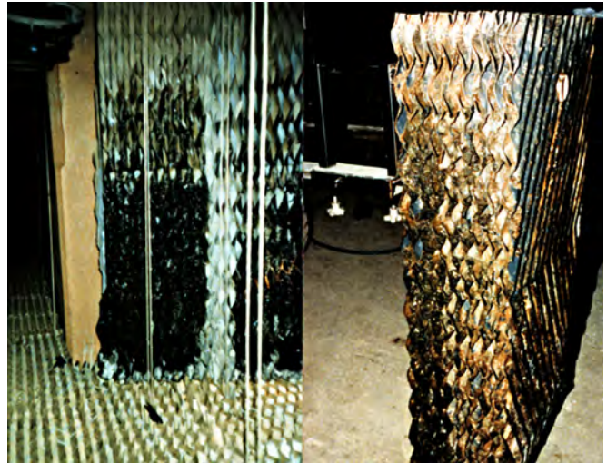
FIGURE 3 Biological fouling is the root of most cooling-loop water treatment problems, according to many experts

All of these effects are dramatic and serious. Biological control must, therefore, be a primary part of good water system control. A picture of a biologically fouled cooling tower fill is shown in Figure 3 .