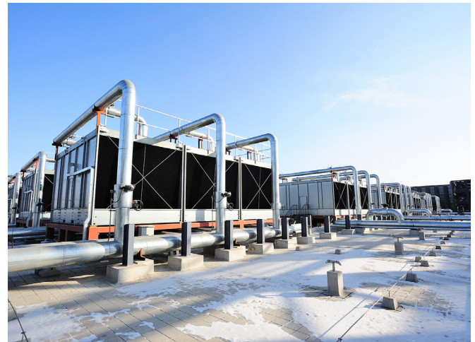
Evaporative cooling towers are an integral part of many data center cooling systems.

To attract customers, data center operators weigh the options and look for systems that reduce operating costs and environmental impact. They pay close attention to power use effectiveness (PUE), defined as the ratio of the total amount of energy used by a data center to the energy delivered to the computing equipment. A PUE of 1 means