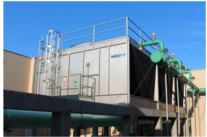
Some systems can utilize “free cooling” or “water-side economizer” technology for higher efficiency.

According to Chiddix, municipalities requiring data centers to use less energy and water onsite may not have considered the full implications of these requirements. In his opinion, if the power generating plant is considered in the equation, the cooling technologies selected for the data center may actually result in more overall energy and water use.