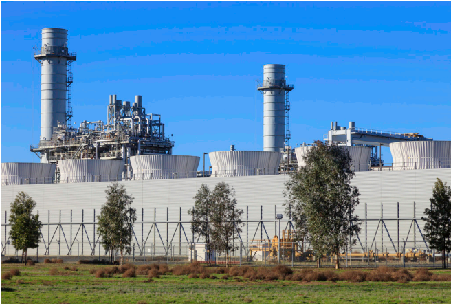
Mechanical evaporative systems are often more efficient than dry systems, reducing water usage at power plants.