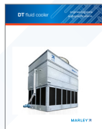
Engineering Data and Specifications

For further information about the DT Fluid Cooler – including engineering schematics, data, layout requirements and more – download at spxcooling.com