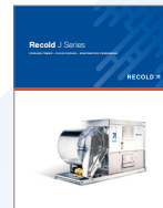
Recold JW Fluid Cooler