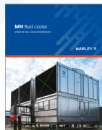
Marley MH Fluid Cooler

SPX Cooling offers a full line of industry leading products – with unmatched support and innovation designed to help you get the most out of your cooling process. Take a look at these and other cooling products at spxcooling.com .