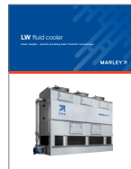
Marley LW Fluid Cooler